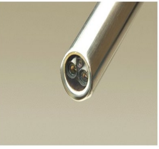
Fig 4. The binocular endoscope consists of two parallel glass rods, each of which transmits a picture to its own camera head.

According to Habuza et al. [8], the area of AI and robotics has made significant advancements in addressing the urgent requirements of the healthcare industry during the ongoing epidemic. Scholars and inventors are offering novel remedies for the escalating difficulties encountered in the healthcare industry because of the COVID-19 pandemic. This section examines the various areas in which Robotics and AI have made significant contributions towards improving the circumstances during the ongoing pandemic. These areas include disinfection, diagnosis, service automation, risk assessment, supply chain management and delivery, tele-healthcare, surveillance, and the acceleration of drug and research development.