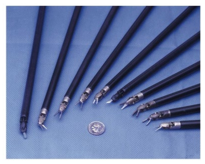
Fig 3. Multiple 8 mm enchanted instruments