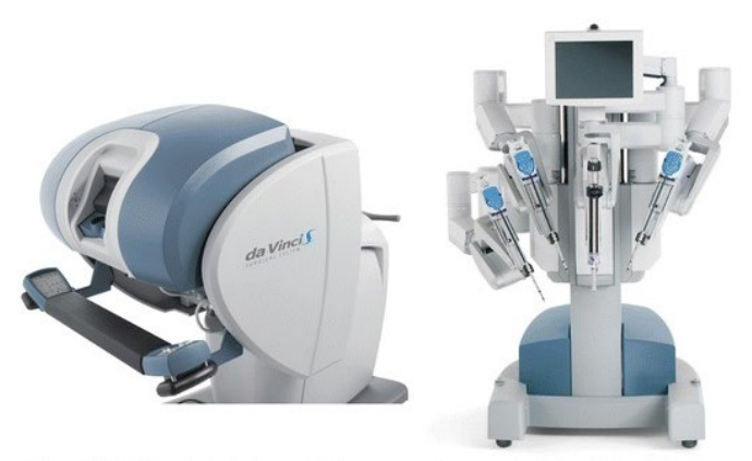
Fig 1. The da Vinci S surgical robot. On the left is the control panel for the surgical robot, and on the right is where the surgeon will stand.

for controlling instruments with three robotic arms (see Fig 1). The surgeon's console is equipped with two viewers, each dedicated to one eye, that provide a three-dimensional perspective of the surgical site. The surgeon assumes a seated position at the console, placing his hands on the control grips that facilitate arm, wrist, and pincer movements (see Fig 2). The hands of the surgeon are positioned in alignment with the visual axis and are responsible for manipulating the wristed equipment, which offers seven degrees of freedom (see Fig 3). The instrument drive system, which is operated by a robot, consists of a tower with three articulated arms. Two of these arms are responsible for manipulating various surgical instruments with a diameter of 8 mm, while the third arm is used to operate a binocular video endoscope (see Fig 4).