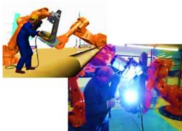
Fig 4. The Multi-Robot Model Helping Workers in the Process of Welding

The objective assigned to the individual was to effectively guide the robot towards the designated positions of the pickers upon their request, facilitate the loading of the occupied crates onto the robot, and subsequently convey them to the designated storage space.