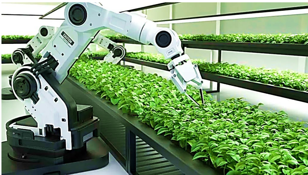
Fig 6. The Robot Integrated in the Greenhouse for Hydroponics