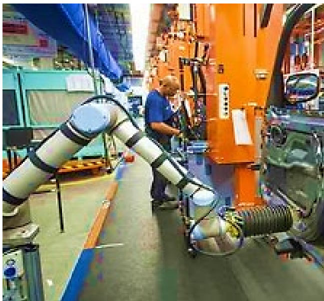
Fig 1: Robot Helping Humans to Complete Final Door Assembly of BMW plant.

depicted in Fig 6, the utilization of robots assists human operators or farmers in the process of hydroponics. In this scenario, it is imperative to incorporate measures to ensure the safety of both the robot and the human operator. Moreover, the robot was operated from a remote location by an operator who was physically present at the same site.