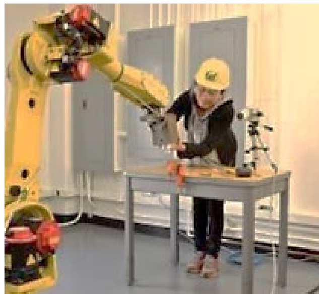
Fig 2. The Human and the Robot Employee Collaborate in Handling Different Pieces of Work